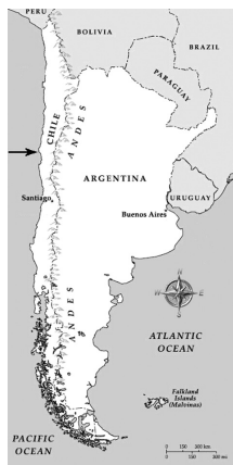
FIGURE 1. Map of South America. Arrow shows the 'Punta de Choros' headland where M. peruvianus specimen GPS004 was collected.

Interviews with local inhabitants revealed the existence of skeletal material of several cetaceans, some of which was donated to the CMMR collection. Among the specimens from 'Los Choros' beach, south of Punta de Choros (29°17.04'S, 71°23.54'W) (Fig. 1), was a small beaked whale skull, without mandibles or other body parts (Fig. 2), but with some fresh soft tissue attached when collected in May 1995. Identified as M. peruvianus from its cranial characteristics (see below), the skull was donated to CMMR in March 1998 and assigned specimen code GPS004. Between its finding and archiving it was left to dry, without further handling, on the roof of the collector's house.