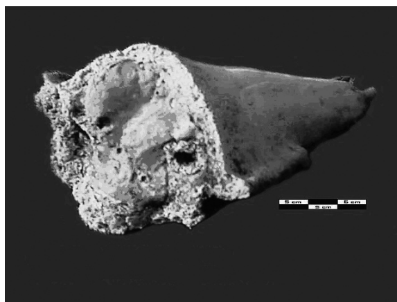
FIGURE 3. Posterior view of the transversal fracture facies of the rostrum of M. peruvianus specimen GPS004. Scale shown is 3cm.