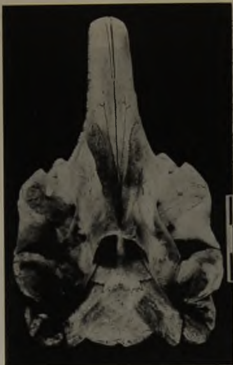
Figure 1C. Ventral view