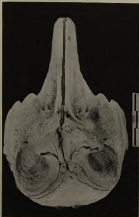
Figure 1A. Dorsal view