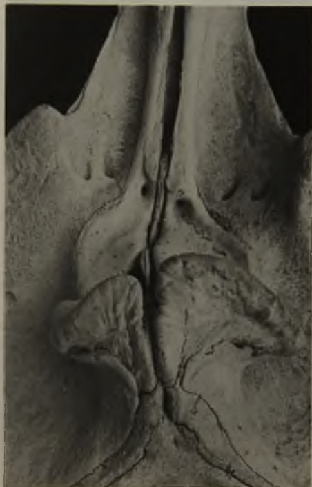
Figure 1B. Detail of the vertex

with almost the same width along the intact part of the rostrum. The vertex axis is skewed to the left for 20.5^\circ in relation to the long axis of the skull. The premaxillary crests are massive; their greatest breadth is larger than that of the premaxillae at the level of the anterior border of the nares. Both anterior tips of the premaxillary crests project forward but only the right one overhangs the nares. The dorsal face of the nasale is elongated and slender with almost parallel long axes. The space separating left and right nasals is wedge-shaped and at its widest point does not exceed 15 mm (Fig. 1B). The right nasale (87 mm in length) almost reaches the anterior end of the adjacent premaxillary crest. The left nasale measures 71 mm.