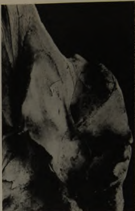
Figure 1D. Ventral aspect of the antorbital region

outer edge of the jugale. The vomer is widely expanded and triangular in shape, with an irregular rear border. The zygomatic processes of the squamosals are large and massive.