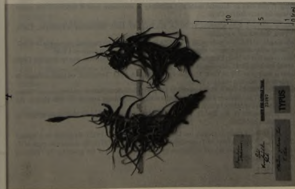
Fig. 4. Holotype of Tillandsia paleacea Presl, collected by Thaddeus Haenke, labelled probably erroneously "Chile" (PR).