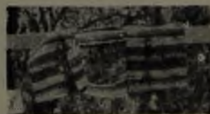
Plate No. 3 - Ver página 298