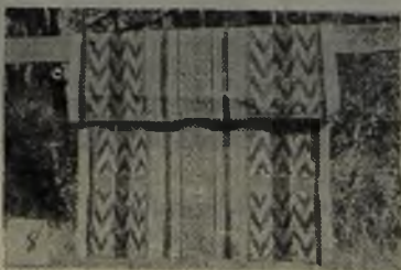
Plate No. 2 - Ver página 298